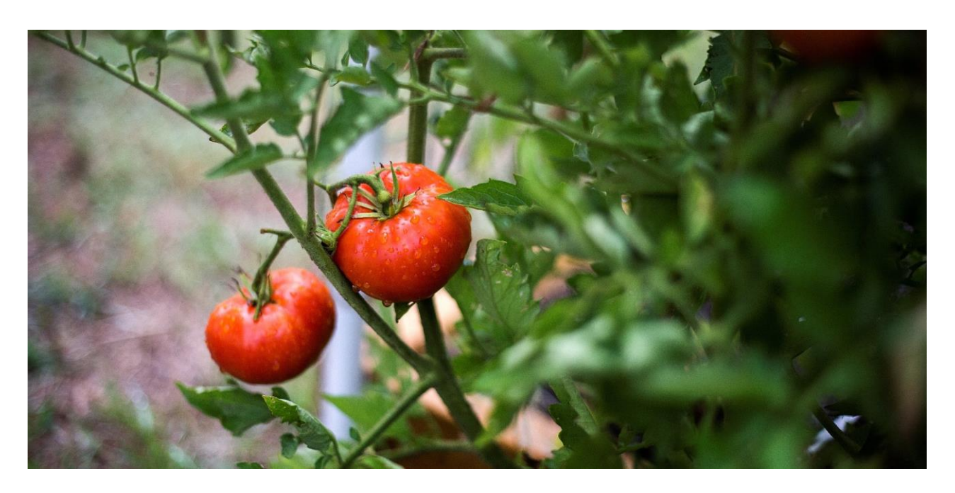
SC Farm to Institution