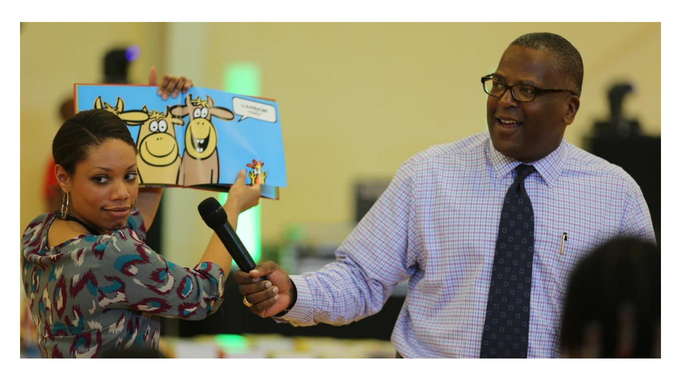
"If we can make reading as popular or as fun as sports... we'll change their outlook and futures." - Mayor Steve Benjamin